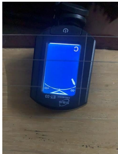
Figure 5. The Frequency Meter, Used to Assist in Tuning the Moon-Shaped Lute, is Called a Tuner

(5) Headstock: It has a leaf-like shape and is attached to the top of the neck. It features 4 string slots and 4 tuning pegs, with two on each side.