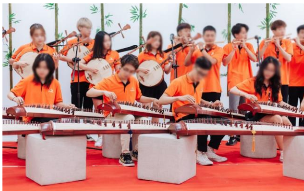
Figure 1. Traditional Musical Instrument Performance

The moon-shaped lute, also known as "Đàn Nguyệt" in Vietnamese, holds significant cultural and historical value in Vietnam. Its origins can be traced back to ancient times and it has been an integral part of Vietnamese traditional music and cultural performances. Understanding the cultural and historical context of the moon-shaped lute is essential for connecting it to educational practices. Exploring the moon-shaped lute within the project allows students to appreciate the cultural heritage of Vietnam and deepen their understanding of traditional Vietnamese music. It provides an opportunity to explore the craftsmanship, aesthetics, and functionality of the instrument.