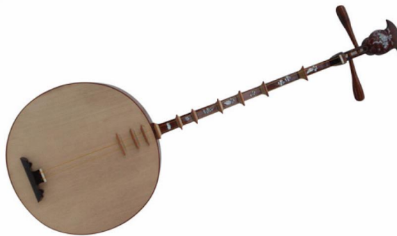
Figure 2. The Moon-Shaped Lute