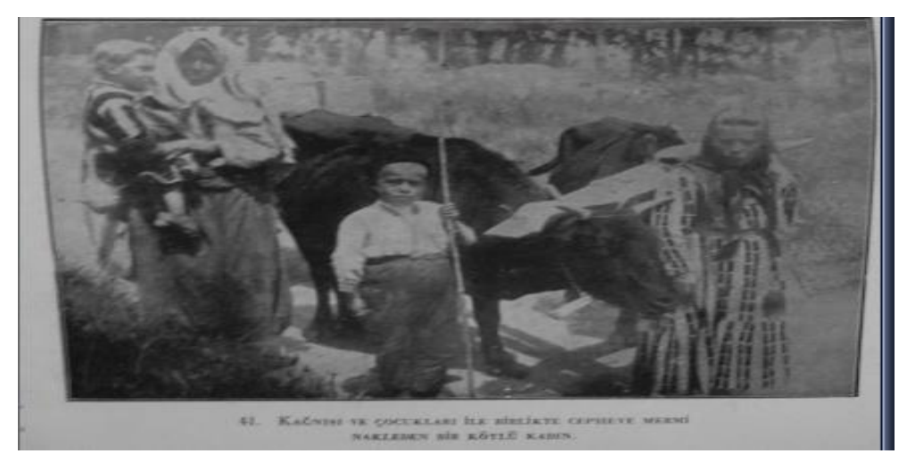
Figure 1. Sample visual of national struggle in history textbooks (TTK, 1934, p.33)

In this context, it is seen that the last historical period that provided the formation of the Turkish national identity in the past is the Republic (Kafesoglu, 2013, p.65). Ankara was the expression of Turkish nationalism such as National Struggle, national independence, national movement, etc. Because, the national struggle consisted of a strong sense of nationalism (Safa, 1960, p.78). The Republic was the resulted of the victory of the Turkish nation under the leadership of Ataturk in the National Independence War against the invading forces (Alakel, 2011, p.25). It can be said that national struggle is a significant historical period and social memory regarding Turkish identity. Therefore, the national struggle and patriotism that the Turkish nation has is the most powerful stage of national identity. In this respect, it is essential that national identity consciousness is given to students in history lesson curricula (MEB, 2012a, p.25). In this context, the example images of the national struggle that reflects the significant historical events of national identity in history textbooks and the patriotism of the Turkish nation can be seen below.