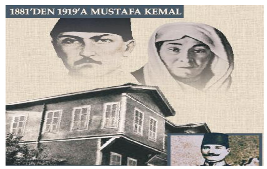
Figure 4. Sample visual of founder leader (M. Kemal Ataturk) in the history textbooks (MEB, 2012b, p.2).

Another element related to national identity is significant historical figures. In the history of societies, there are important historical personalities that individuals can be proud of in their national identity (Zadeh, 2013, p.187). There are many heroes in national histories that individuals can associate with their national identities (Ocak, 2001, p.37). Regarding the Republic history, Mustafa Kemal Ataturk's fellow soldier in the period of National Struggle can be evaluated in this context. Photographs and images of Ataturk's fellow soldier are frequently used in textbooks. On the other side, the "other" is another element that provides for the formation of national identities.