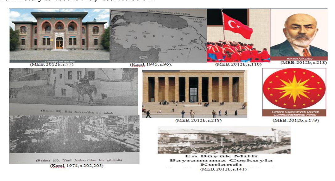
Figure 7. Sample visuals of national symbols in history textbooks (MEB, 2012b; Karal, 1974).

It is seen that Ankara, as a capital city, is symbolized by the Republic established in the national state structure. The capital, Ankara, symbolized the expression of the new state and social life brought by the Republic. Ankara, loaded with new meanings and photographed, was a citizen identification with the national state (Batuman, 2008, p.16). Again, the first parliament building in Ankara, the Republic, Ataturk's monumental tomb, national holidays, national anthem are the symbolic expression of the commitment to the Republic (Aydin, 2009, p.20, Cayla, 2005, p.114, Karabag, 2009, p.474). It is evident that the national symbols are an effective means of experiencing national identities. It is inevitable that such useful instruments are reflected in history textbooks. In this context, the visuals of the national symbols mentioned from history textbooks are presented below.