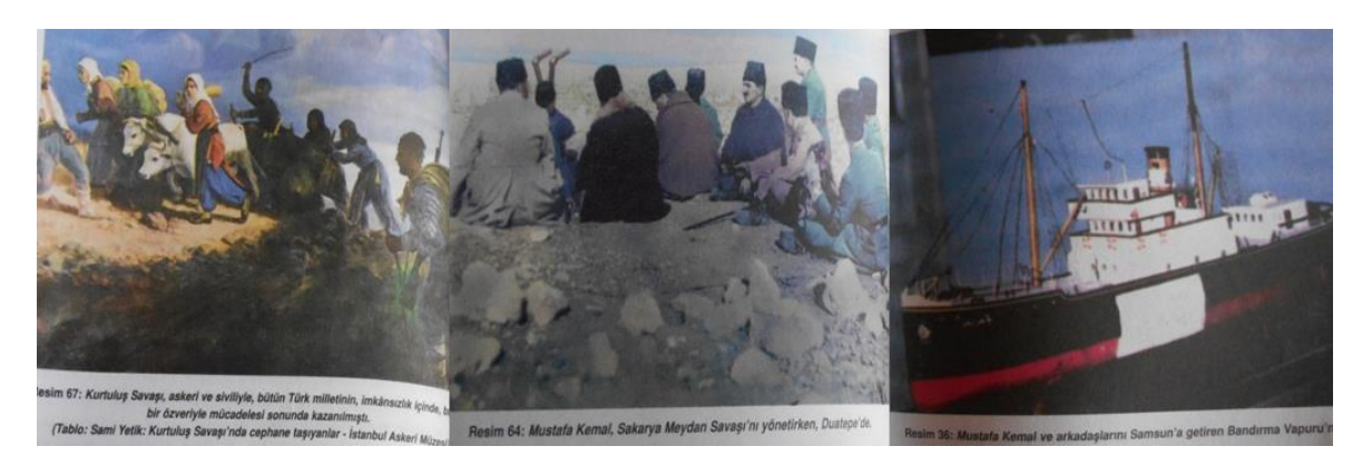
Figure 2. Sample visual of national struggle in history textbooks (Kara, 2006)

It is seen that the "national struggle" element of the Turkish national identity constitutes a visually prominent place in history textbooks. On the other hand, the Republic, which was established as a national state, sought to adopt the concept of its state to the public. When the secular structure of the Republic and the modern values it adopts are taken into consideration, it is more important to bring these elements to the members of the nation (Bolat, 2012, p. 250). Therefore, education was a useful tool in sharing national consciousness and Republic values with the whole society (Duman and Doğdu, 2010). The reforms would also adapt to the nation through the education channel. Because they are the main reforms that constitute the foundation of the Republican values and are the first in the Turkish identity (Turkdogan, 2005, p.303). The two unchanging principles of Ataturk's revolution were nationalism and civilization (Safa, 1960, pp. 83-92).