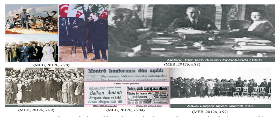
Figure 3. Sample visual of Republic values and reforms in history textbooks (MEB, 2012b).

The Revolution History or the Republic History lesson was a useful educational tool in reaching the stated goals (Bolat, 2012, p. 250). In this context, four volumes of history textbooks were published in 1931. History IV, which is the fourth volume of the book: The Republic of Turkey's book was aimed at gaining an understanding of the national and secular republican values (Aslan, 1992, p. 181). On the other hand, the Republican reforms that form the basis of the national identity found in history curricula were included in the objectives of Turkish Republic Revolution History and Kemalism Curriculum, and it was one of the behaviors to be imparted to the students (MEB, 2012a, p.5-28). Images related "Republican Values and Revolutions" in the history textbooks are presented below.