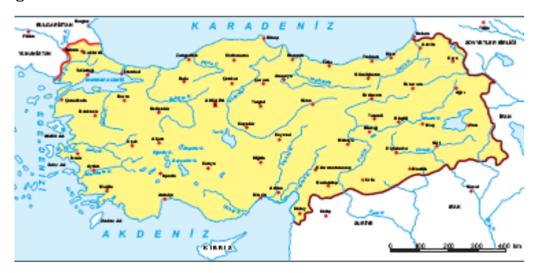
Figure 6. Sample map visual of the motherland map in the history textbooks (MEB, 2012b, p.96)

The maps representing the motherland are one of the important symbols of national identity. Maps are powerful forces of homeland identity (Fortna, 2005, p. 123). Because old maps that are obscure showing the territory of the country have become increasingly clear. It has become widespread in the nineteenth century. Thus, maps do not only show geographical coordinates, but also they became a means of portraying their nations, separated from their homeland (Calhoun, 2007, pp. 17-24). Maps were a symbol of nationalistic sentiment, just like flags and national anthems (Anderson, 1995, p.190-195). In this context, before the foundation of the Republic, it was wanted to impregnate an identity through the concepts of the motherland in the Ottoman state 2013 (Turk, pp. 120-123). When it came to the period of national struggle, the resolutions taken at the Sivas Congress were approved by Meclis-i Mebusan in Istanbul on 12 January 1920; It was sworn for the Misak-1 Milli (Inalcık, 2009, p.16). Thus, the real homeland for the students studying at the Cumhuriyet schools became Anatolia (Lewis, 2000, pp. 355-357). As a result, Anatolia and its representative maps entered the history textbooks as the homeland of the Turks. In this context, the example visuals from history textbooks are given below.