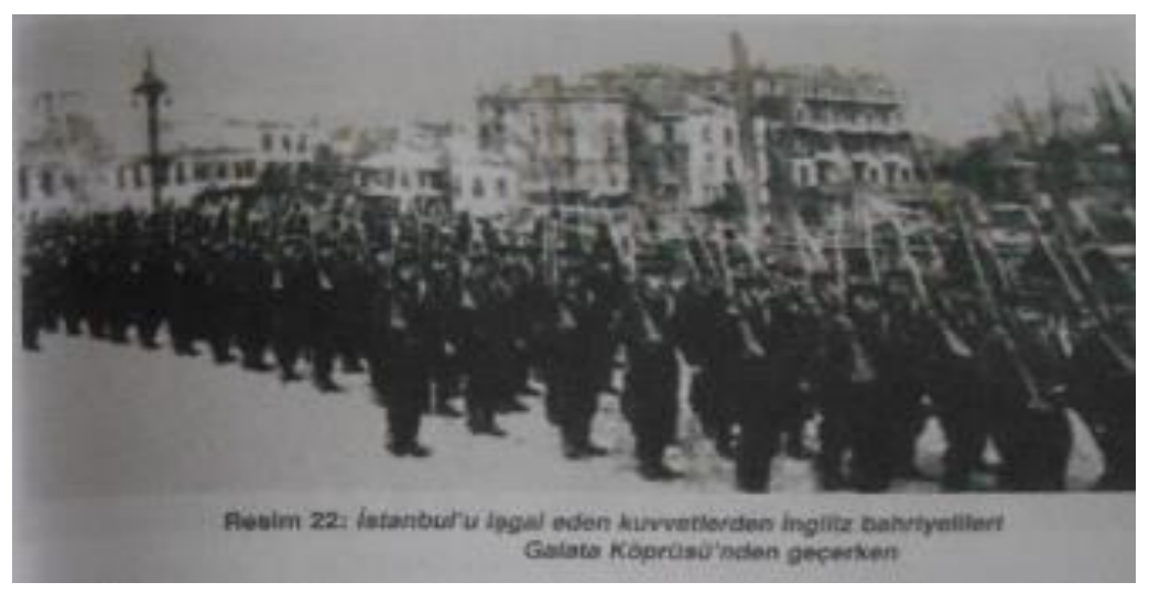
Figure 5. Sample visual for "other" in historical textbooks (Kara, 2006, p.61)

Because, while identifying identities, an "other" develop for those different from oneself. (Gondogan, 2009, p.400). In other words, the difference from the others is the national identity (Kosoglu, 1996, p.40). Indeed, individual and collective identities do not occur only in culture and history. However, this is done by perceiving an identity against the "other" (Guvenc, 1998, p.24). As a result, the "other" realize the formation of national identity and the consciousness of "us." The "other" in the textbooks also became important for national solidarity and unity (Ustel, 2004, p.209). The example of the "other" from history textbooks is presented below.