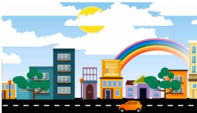
Figure 2. Description About Light