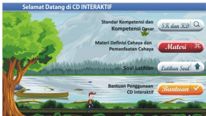
Figure 1. Main Menu

The results of the last product trial were field trials. This trial is the same as the previous trial. But the difference is that the number of samples is greater than the previous test. The samples needed in the trial in this study were 15 students. The results of the field trials obtained an average score of 83.09. These results fall into the category of good and decent. So, it can be concluded that from the three final product trials, the initial product of the media is feasible to be tested for its effectiveness. Originally called the initial media product, it has now become a final product that is ready to be implemented and tested for effectiveness in science learning in the fifth grade of elementary school on material of the properties of light. The samples' looks of the initial product are captured in Figure 1, Figure 2, and Figure 3 as below.