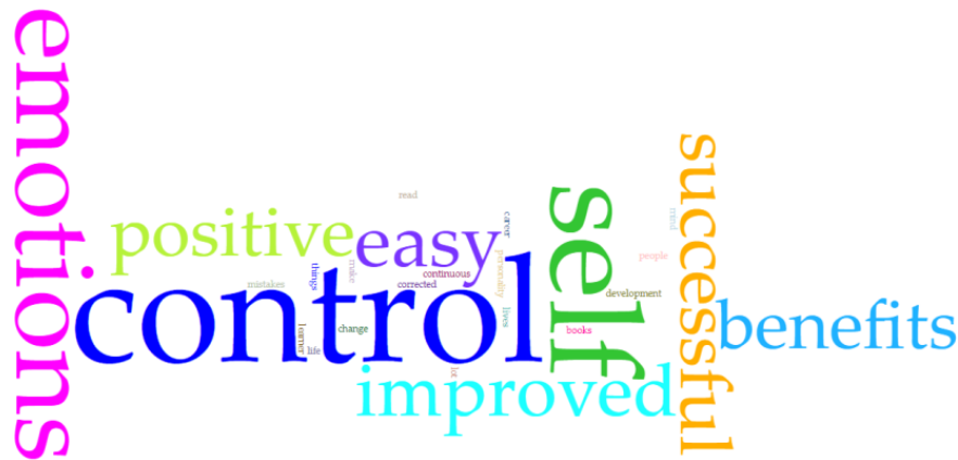
Figure 3. The content analysis of the responses provided by the focus group volunteers to the first question

Question 1. The content analysis of the responses provided by the focus group volunteers showed that the five most frequently used words to answer this question were: control, self, emotions, benefits, easy (see Figure 3).