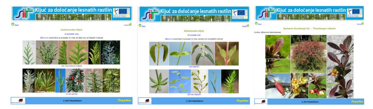
Figure 1: Examples of identification steps from the dichotomous identification key (Slovenian version).

First, the identification process with the key was briefly presented to the pre-service teachers. It was explained to them that they would use an identification key, whereby they had to choose one of two alternatives at each step. The students had familiarised themselves with the identification keys before the experiment, so only a quick trial was carried out, showing them the first few identification steps with the key to get an idea of how it works.