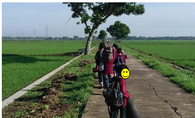
Figure 5. Students' backpacking

"Students are demanded to visit a place with a limited budget. So, students should wisely stock their food with friends. They should also take care of themselves and interact with society. As they are required to stay when backpacking, students should ask for permission to the society. Teachers have prepared the lodge though”.