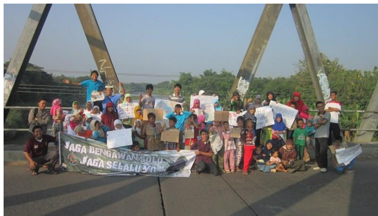
Figure 6. Students' social project

"In order to improve students' empathy, the school frequently collaborates with other parties or social communities. For instance, the last November our school collaborated with a social community, Aman Palestine. They educated our students about things that happened in Palestine by showing some videos and stories".