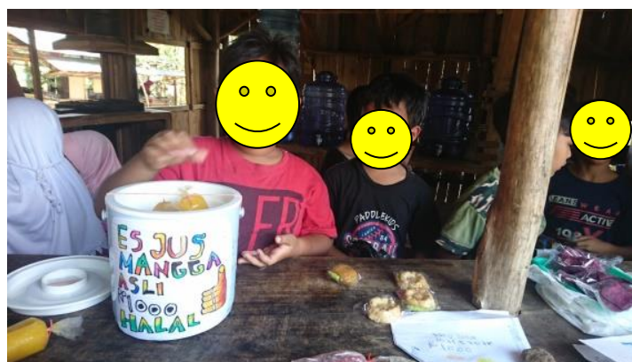
Figure 3. Students' trading activities in the Sell Day

"Students are encouraged to trade, starting from the preparation stage until the final stage, reporting the sales results. Students are also trained to interact with society by bargaining with them during trading activities. During the "Sell Day", students learn how to start communication by offering or marketing their goods".