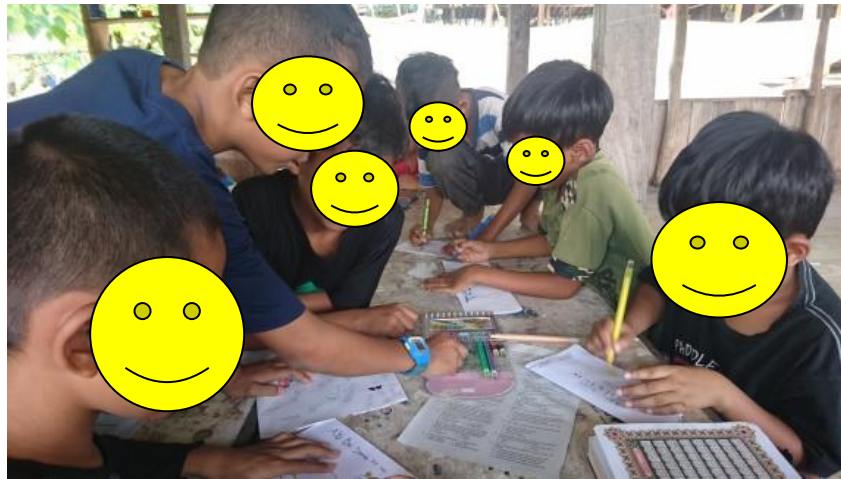
Figure 2. Group discussion in the learning process