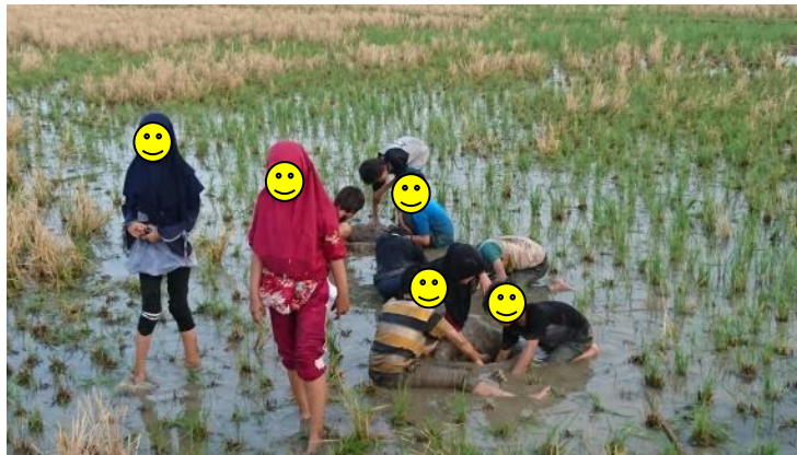
Figure 4. Outing class

outdoor or outing class. Then, their work which is a worksheet is presented in front of the class. After the presentation, students continue the question and answer session. The students need to give or receive appreciation for their work”.