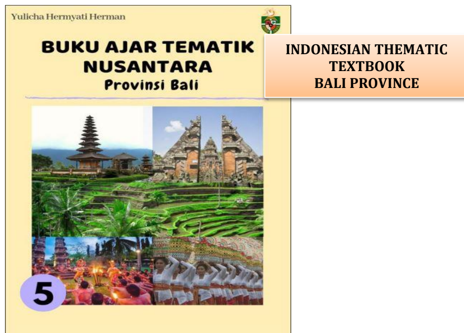
Figure 2. The example of the student submitted assignment (Indonesian version and English translation)

Prior to conduct the writing printed modular based learning materials tutorial, the students had to take pre-test regarding the entry knowledge of the writing skills. After pre-test the participants followed the tutorial session of the printed modular based learning materials writing. In this present study the participants took the post-test which related to the course objectives. The pre-test and post-test results were analyzed to get the information regarding the students gained knowledge and writing skills after learning with the mind map approach.