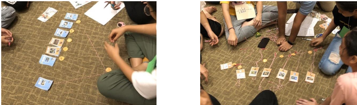
Figure 3. Student construction of chordates' phylogenetic tree in small groups

characteristics of the organisms within the same class. This would become more evident when they choose one representative species and fill in the characteristic table as described in Table 2. Furthermore, while students construct the phylogenetic tree, they use the rope to tie into a node to make it a common point of evolution before the evolutionary separation (see Figure 3). This allows them to understand the meaning of branch and node, to exercise how to read across the tips, and to observe the relative placement of taxa, as shown by the increased mean score after participating in the VERT card game activity.