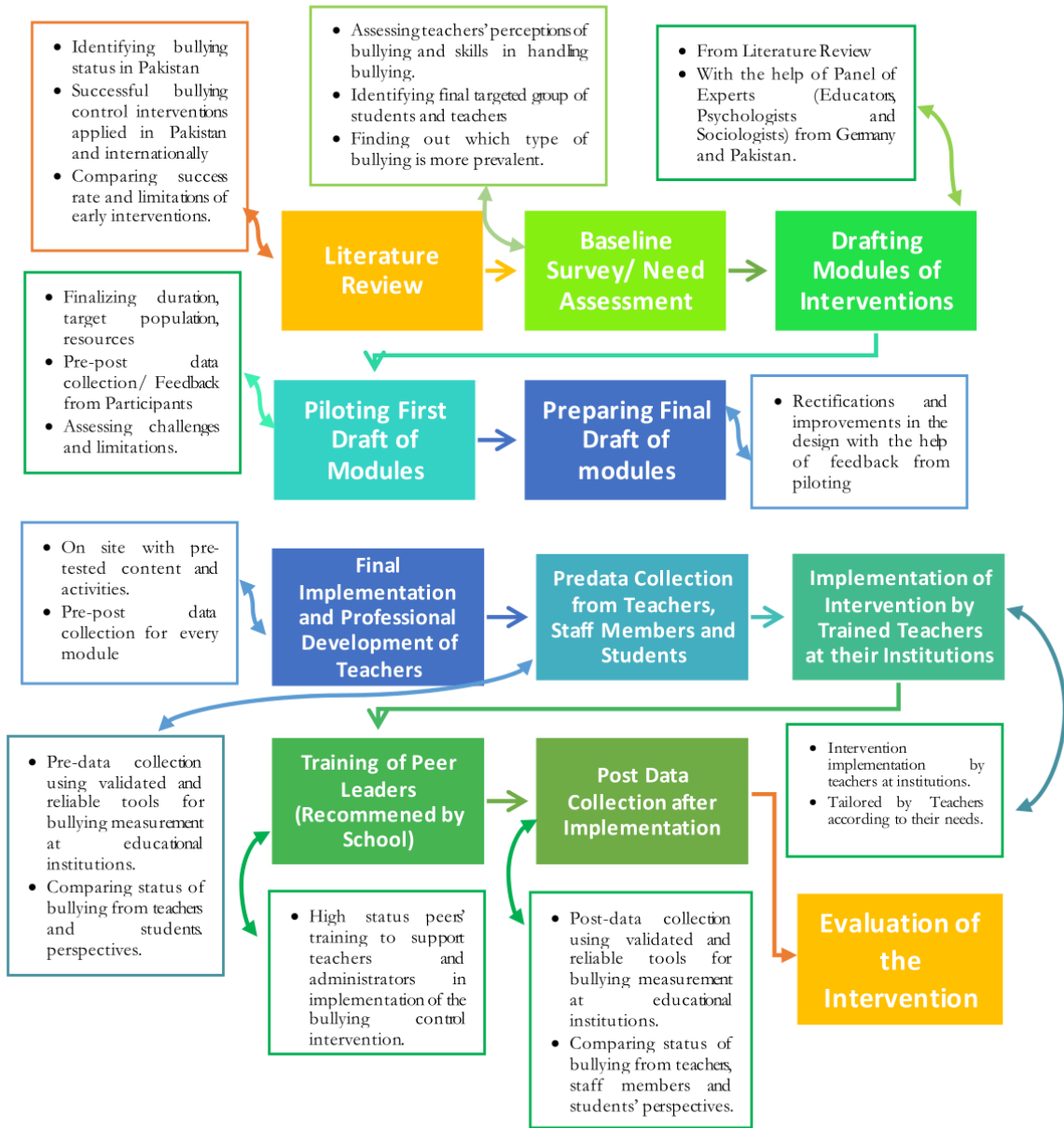
Figure 1. The Step-by-Step Process of Developing the Sohanjana Antibullying Intervention