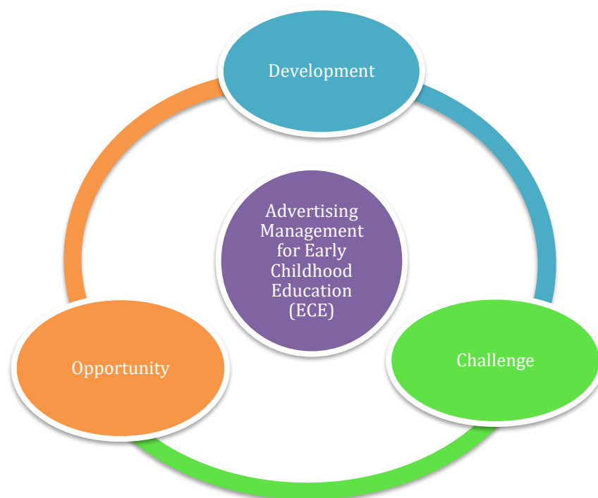
Figure 1. Navigation Chart for Early Childhood Education Advertising Management

This study aimed to fill a gap in existing research and provide an overview of the application of supportive management in the ECE setting. In addition, this research paper detailed the historical developments, opportunities, and challenges of advertising management in ECE. The findings were presented as a guide for teachers, schools, and parents. In addition, this research helped education policymakers manage ECE advertisements under the school's needs, vision, mission, and goals.