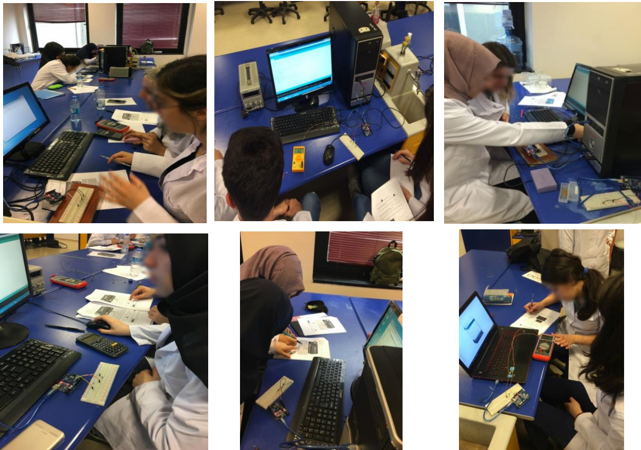
Figure 4. Studies of students related with Arduino circuits

The Electronic Support System offered by our university has been used very effectively in terms of sharing documents and making students active outside the classroom. The experimental paper prepared for the laboratory course is shared weekly homework and questions are directed through this system. The weekly sharing of all experiments is important in terms of making some changes according to the readiness of the students and raising curiosity for the experiment. The images of the students being taken during the experiments are shown in Figure 4.