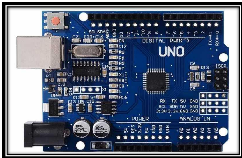
Figure 1. Arduino Uno cart.

Arduino is an open source physical programming platform (Dokmetas, 2016). It can be considered as a stand-alone computer. Arduino does not only consist of microcontroller cards, it is also the most preferred project development platform with its extensive library, sample projects and easy-to-learn language. Arduino's programming language is the most common C / C ++ language (Dokmetas, 2016). Arduino can be downloaded for free from its official site (Arduino, 2017). Arduino cards are very easy to obtain and programming is becoming more fun. The Arduino card is shown in Figure 1.