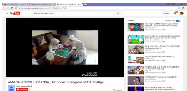
Figure 6. MANSA Historical Board game uploaded on YouTube

Furthermore, instructional media that have been developed by students on historical subjects in the form of the MANSA Historical Board game are also uploaded on social media such as YouTube. This is done with the aim that high school students, teachers, practitioners, and other researchers can use these learning media and can develop learning media similar to modify them. Therefore, Figure 6 shows the MANSA Historical Board game that has been uploaded on YouTube.