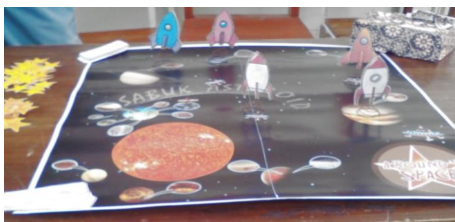
Figure 4. Round space game

This board game discusses the meaning of history, there are chance cards, destiny cards, question plots, bomb signs, and flip images. The way to play is very simple, the player only needs to roll the dice, and follow each of the instructions in each game box. Historical material which is used as the basis for making anonymous board games is material regarding the concept of history. How to play is explained as follows, the player consists of 5 people, each player rolls the dice, if one player gets the highest number of dice then he becomes the first player, the first player after rolling the dice will get the number of steps he has to run the token on each box when stopping in a box, the player must follow the instructions in the box. The instructions can be various, such as answering questions about the meaning of history, the importance of learning history. If the token stops at the bomb sign, it means that the player cannot continue the game for one round. This game is over if one of the players reaches the finish, the player who reaches the finish first is declared to win the game. Furthermore, the Round 'space game is complete with spaceship tokens and stars, as shown in Figure 4 below.