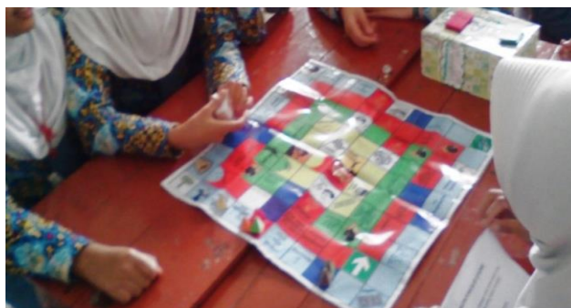
Figure 3. Anonymous game

The results of the MANSA Historical Board game by students can be shown in Figure 2 to 4. There is a student's group who named the Board in the form of an-Anonymous Game as shown in Figure 3 below.