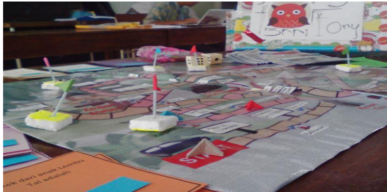
Figure 5. Seizure of territory games

How to play, the player must have a maximum of 5 members to start on the specified planet, the first turn player determines the planet he wants to visit, then jumps to the next planet in the order of the planets in the solar system. Every player is on one planet, he is obliged to answer the questions on that planet, if he answers correctly and progresses according to the order of the planets correctly gets two gold stars, if wrong then he does not get stars, and must return to the previous planet. The player who gets the most stars is the winner. Meanwhile, students then refer to the game as the Seizure of Territory that can be shown in Figure 5 below. This game tells the story of power struggles between kingdoms in the Hindu-Buddhist era.